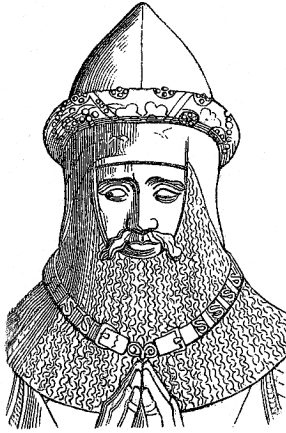
From his effigy : after C. Stothard.

1397. RALPH NEVILLE III., son of John, Lord Neville of Raby (1) : Earl of WESTMORELAND, & Baron de Neville of Raby & Middleham, Lord of the Honour of Richmond.